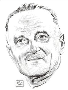
Gen. Carl A. Spaatz, USAF

The 1994 National Board Meeting in New Orleans witnessed a landmark event. The 30 th Anniversary of the CAP Cadet Program was being celebrated. This inspired the first "Gathering of Diamonds" reunion of winners of the Gen. Carl A. Spaatz Award (dubbed "Spatzen").